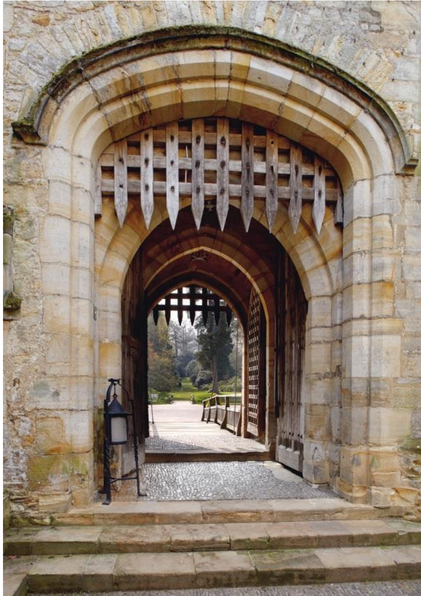
View of Castle Gatehouse as seen from the Courtyard