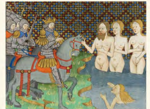
Royal MS 15 E VI, 1444-1445 Poems and Romances (the 'Talbot Shrewsbury book').

The central panel shows two figures like Adam and Eve facing each other. Their faces resemble early portraits of Henry and Elizabeth, and the form of their bodies can be closely compared with illuminations in the fifteenth-century royal library.