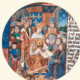
MS Arundel 66 f. 201 r. Henry VII is presented with a book containing astrology and prophecy. A bishop points to the stars demonstrating the king's reliance on theology and prophecy.

The stars could be divided into groups of three and four as they appear in the sky: four stars represent the four cardinal virtues (prudence, justice, fortitude and temperance) which medieval writers associated with the qualities of Christ-like rule; and the remaining three, the holy trinity.