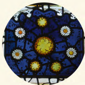
Early fifteenth century glass, All Saints North Street, York

The seven stars were used in the London pageant for the next royal wedding, that of Catherine of Aragon and Arthur (who was likely conceived on this bed, and probably named after Arcturus). This is how he was presented: