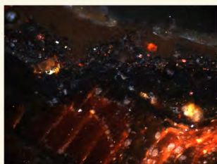
Sample of the primer and wood from the bottom left quarter of the bed

A similar coal primer has been found in contemporary wall paintings, and The National Gallery identified coal primer in early panel paintings. All of the bed's original pigments and binders were in use in the early Tudor period in these combinations, and none were invented after c.1650 when artificial pigments became common.