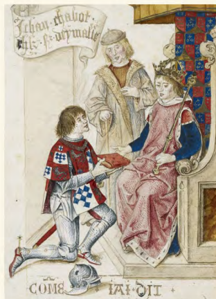
©The British Library Board, Royal 19 A. V. f. 1v Jehan Chabot and Henry VII

The age of the bed is revealed by the remains of its historic paintwork. Under the varnish, traces of late medieval decoration have been found. A textured coal primer supported a red-brown grained effect with areas of white marbling. 'Walnut-tree colour' and marbled beds are listed in the wardrobe accounts of Henry VIII, and such a combination of warm brown and white paint effects can be seen on a coloured drawing of a throne of Henry VII from 1496.