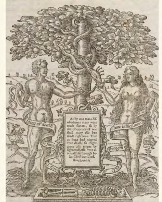
The Genealogies of Holy Scriptures, John Speed, 1611.

This simplified the subject as simply Adam and Eve sinning, as acceptable to Protestants.