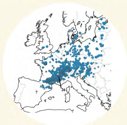
Distribution of haplotype 7 across Europe suggests the wood most likely came from the continent

DNA testing of the timber has proved that all samples from posts, lion finials and headboard are European oak and of a subspecies ('haplotype 7') found in an area stretching from southern France, through southern Germany to Belarus. This is typical of the origin of the finest, slow-grown oak imported by medieval elites: Edward III used boards from Latvia for his bed in 1360.