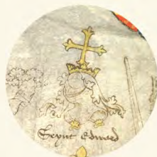
Add MS 48976 f.8ar, The Rous Roll, c. 1483. Parade helmets, one showing the symbol of St Edward the Confessor as a simple Cross Fleurie.

In the 1480s, Edward the Confessor was sometimes symbolised with his distinctive 'cross fleurie' on parade armour.