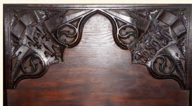
St Chad's Rochdale