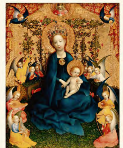
Madonna of the Rose Bower, Stefan Lochner, c.1448

In Genesis, Adam and Eve brought the fall of man through the Tree of Knowledge of Good and Evil. The Old and New Testaments have similar stories called 'types'. The equivalent to Adam and Eve was Christ and Mary, the redeemers who present the heavenly Tree of Life in the Book of Revelation. The idea of an apple signifying temptation was reversed when held by Christ and/or the Virgin Mary: it became a sign of redemption. Fifteenth-century artists favoured this imagery, set within a paradise with red and white roses, the devices of Henry and Elizabeth.