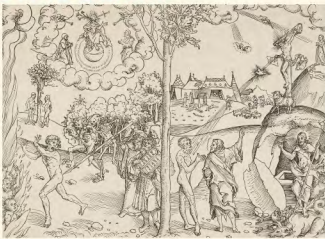
The Old and the New Testament, or allegory of the law and the gospel, c.1528 attributed to Lucas Cranach.

The beautifully carved headboard of the bed is its main focus, divided into three openwork panels. It represents the theme of redemption from the downfall of man, interpreted through the lens of royal marriage.