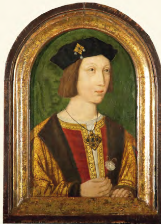
Arthur Prince of Wales Anglo-Flemish School, c.1500

'O Mary and Elizabeth, O fruitful kindred, blessed mothers of all mothers, through whom God especially wrought the new work of bringing forth offspring, to the wonder of nature... these women's wombs were filled... by whose fullness the demons are crushed, people saved, and angels restored... whatever was good in Elizabeth's childbearing is given by grace of Mary's son... and after the wombs were filled, the servant recognized the saviour-king.' (O Maria et Elizabeth)