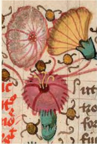
©British Library Board, MS Arundel 66 f.53, Detail of Astrological compilation and political prophecies, 1490 A gillyflower marries a garland of daisies to one of marigolds, the border showing red and white roses combined.

They are stripped of all colour, but that on the left seems a daisy (a medieval symbol of Christ), the larger on the right a marigold (a late medieval symbol of the Virgin Mary). It has gone unnoticed by scholars that the king and queen used these flowers to represent themselves.