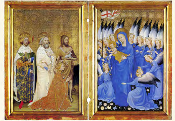
The Wilton Diptych c.1395-9. Made for Richard II who did much to remodel royal Westminster. It shows the role of St Edward the Confessor supporting the king's direct relationship with Christ and the Virgin. The flag of St George is upheld in heaven.

St Edward the Confessor was the model for Christ-like English kingship, and his shrine remains the focus of Westminster Abbey, around which late medieval monarchs were interred. The bed shows the Confessor's shield - a 'cross fleurie' - from which a tree grows. This life-giving symbolism represents the obscure Westminster legend of the Arbor Fertilis .