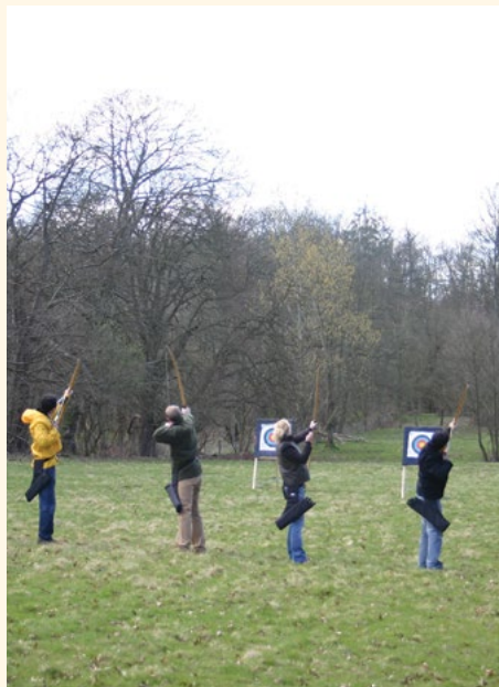
Images: 1 Archery, 2 Apache Rally Cars, 3 Quad Biking