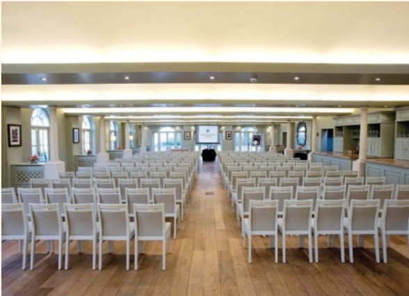
Images: 1 The Loggia, 2 The Guthrie Pavilion, 3 The Guthrie Pavilion, 4 The Guthrie Pavilion