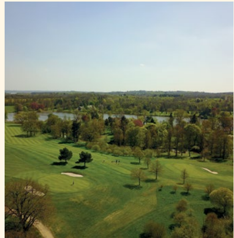
Images 1 & 4: Championship Course, 2 Golf Days, 3 The Waterside Terrace