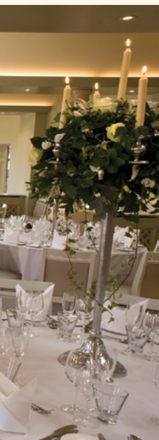
Images: 1 Accommodation, 2 The Tudor Suite, 3 The Guthrie Pavilion