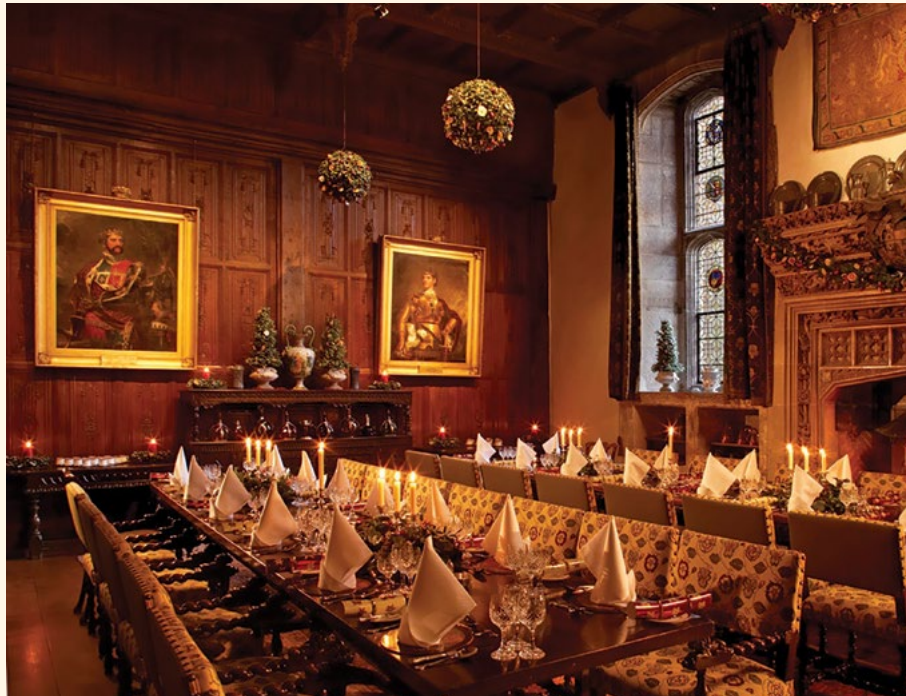
Images: 1 Astor Wing Bedroom, 2 Castle Inner Hall, 3 Portcullis, 4 Castle Great Hall