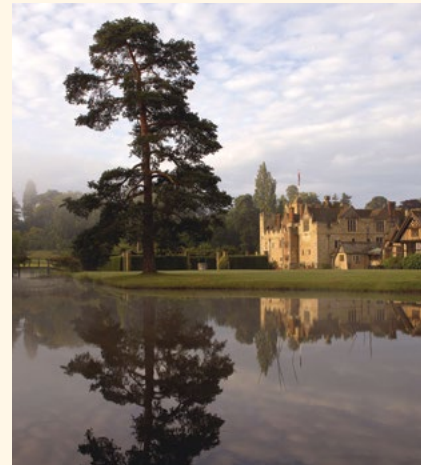
Images: 1 The Guthrie Pavilion, 2 The Tudor Suite, 3 Hever Castle, 4 The Astor Wing