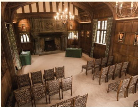
Images: 1 The Tudor Suite, 2 Lawn Croquet, 3 The Tudor Suite, 4 The Billiards Room