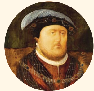
KING HENRY VIII